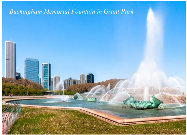
Buckingham Memorial Fountain in Grant Park

Signature at the 95 th for dinner to discuss our day! After dinner, we are free to explore the local nightlife, maybe at the Jazz Showcase club or a local comedy club. B, D