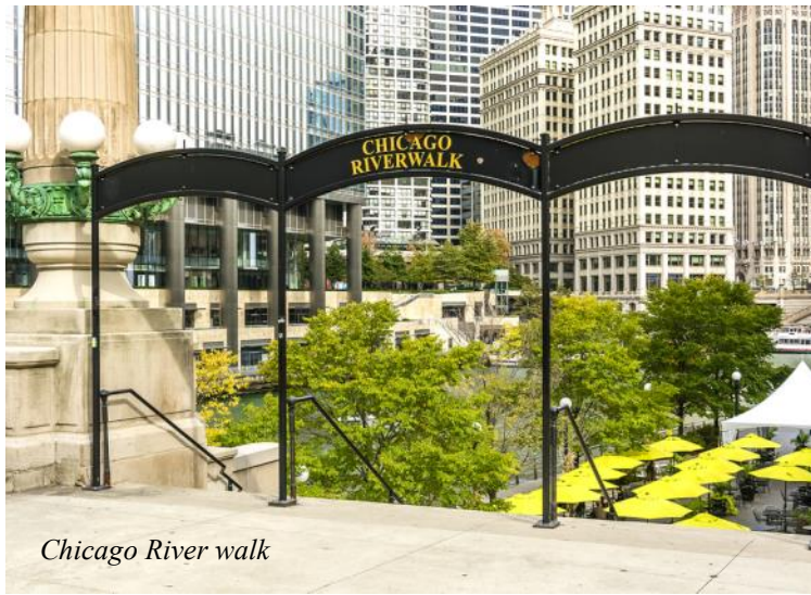
Chicago River walk