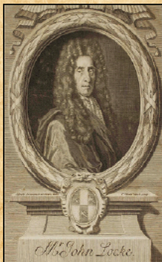
JOHN LOCKE, AN ESSAY CONCERNING HUMAN UNDERSTANDING, 1694